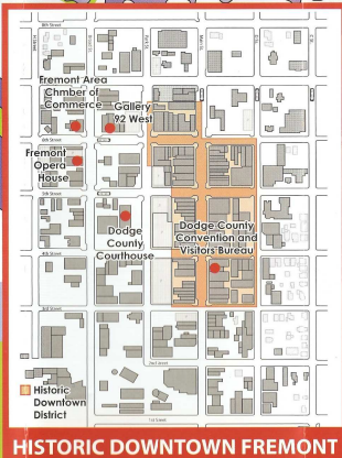
HISTORIC DOWNTOWN FREMONT

Additional copies of this free map can be obtained by contacting the Fremont & Dodge County CVB at: (402) 753-6414 or director@visitfremontne.org